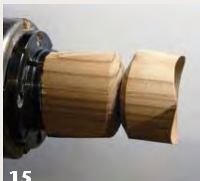
15 Part off the tea light holder by forming a concave area at the bottom.