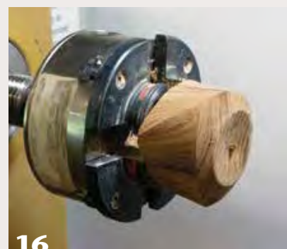
16 Reverse-mount the holder, using the chuck in expansion mode, to complete the bottom.