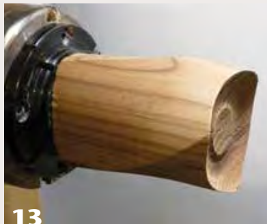
13 Begin a tea light holder by turning a concave shape at the end of the twisted spindle.