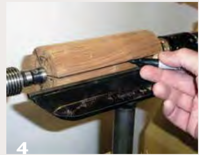
Extend the section lines down the cylinder to the opposite end, either freehand or with the aid of the toolrest. Locate and punch the three turning points at the opposite end, and label them as you did the first end.