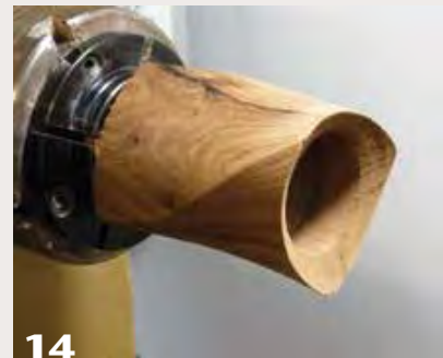
14 Use a Forstner bit to drill into the spindle deep enough to allow the tea light candle to sit all the way in and flush with the top.