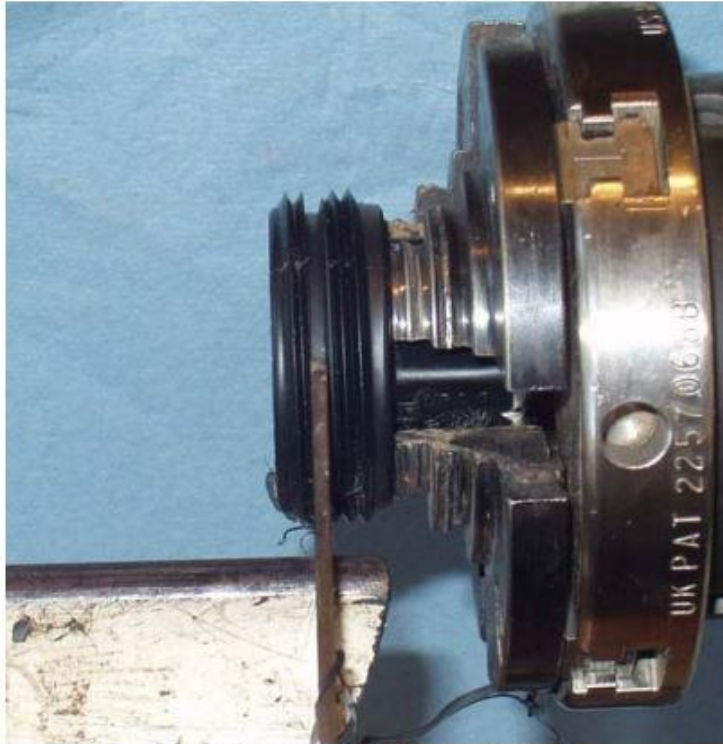
Part off about \frac{1}{4} " of the male threads.