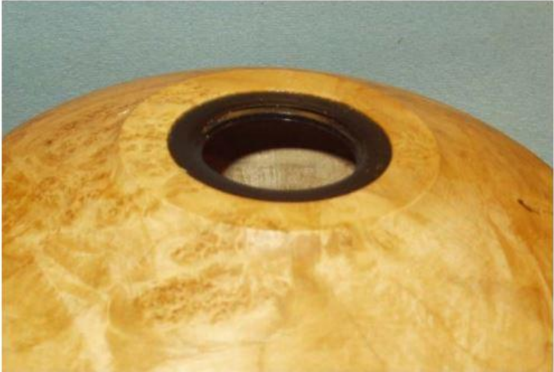
Here are the female threads glued into the neck of the urn.