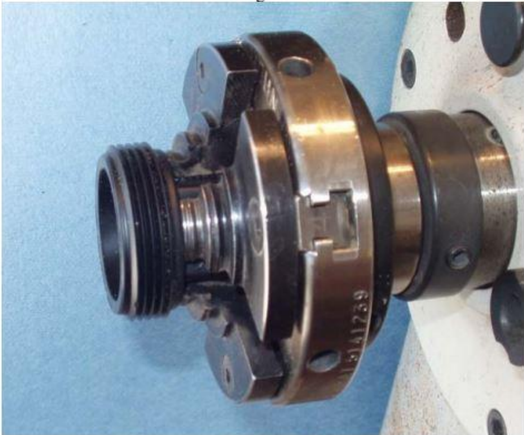
Grip the square end of the male part in a chuck.