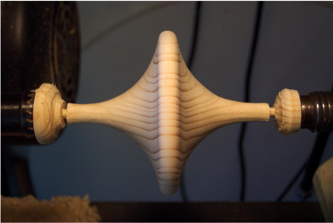
Ready to cut off the ends.

Use a knife to gently pry the two halves apart. Peel off the tape, rotate one half 90°, and glue it together.