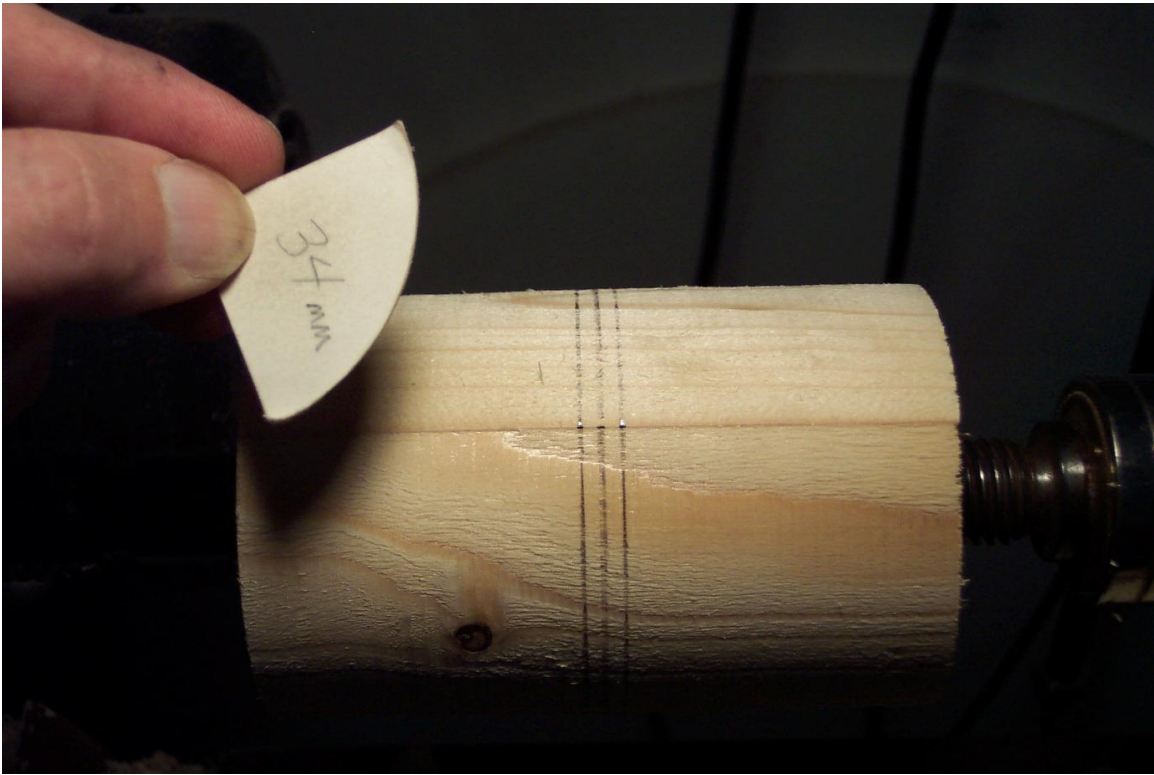
Center line and edge thickness lines drawn. Template is based on the diameter of the cylinder at the center line.

Symmetry is the key to successfully turning a femisphere (see diagram below).