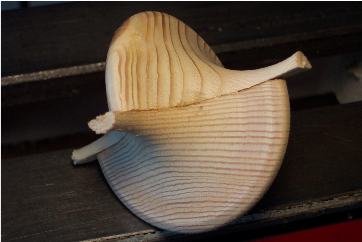
Twisted and glued.

Use a knife to gently pry the two halves apart. Peel off the tape, rotate one half 90°, and glue it together.