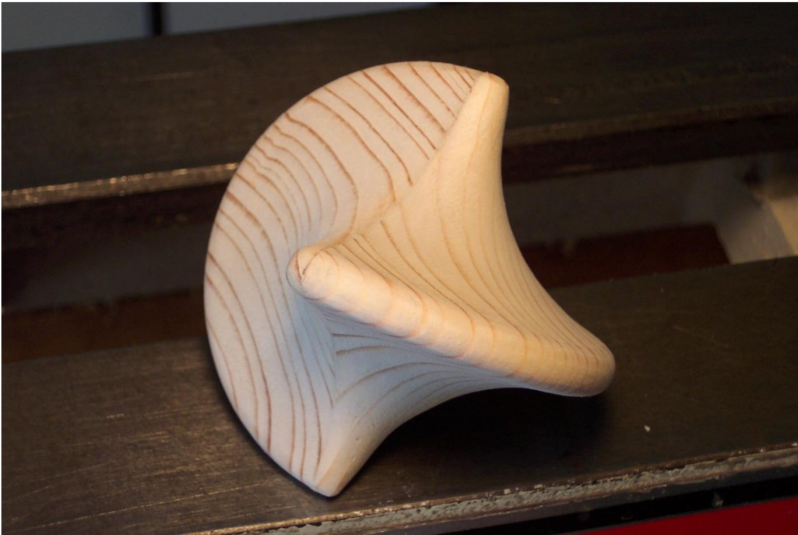
Ready to roll!

I use a small belt sander to remove most of the waste at the tips and a small drum sanding attachment in a Jacob's chuck to sand the tips flush. In spite of your best efforts at symmetry, the edges probably won't match perfectly and will also need the drum sander to make them flush. Be sure to use a drum with a smaller radius than the femisphere. Sand the rest to finish grit by hand. Then apply the finish of your choice.