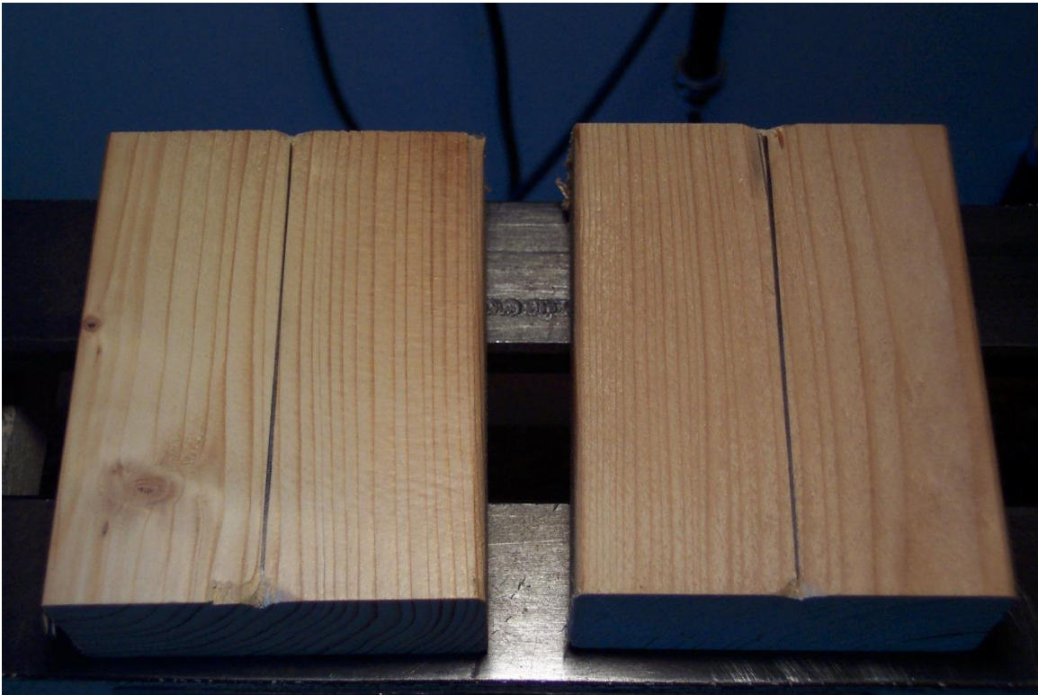
Two pieces with notches cut on the ends.

I recommend using double-stick tape instead of a paper joint or a few drops of CA for several reasons: