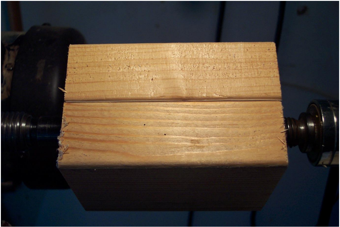
The blank is ready to go.

Turn the blank into a cylinder. True up both ends just enough to make consistent edges to measure from. Find the center and draw a vertical line all the way around. Choose an arbitrary thickness for the edges (I use 6mm) and draw lines on either side of the center to match this thickness (3mm on either side of the center). Measure the diameter of the blank, divide by 2 to get the radius, and then subtract half of your chosen edge thickness. Use this value as a radius to create a \frac{1}{4} circle template from a piece of cardboard. Use of the template will guarantee that the width and height will be the same and guarantee the same thickness on the left and right ends as the vertical edge.