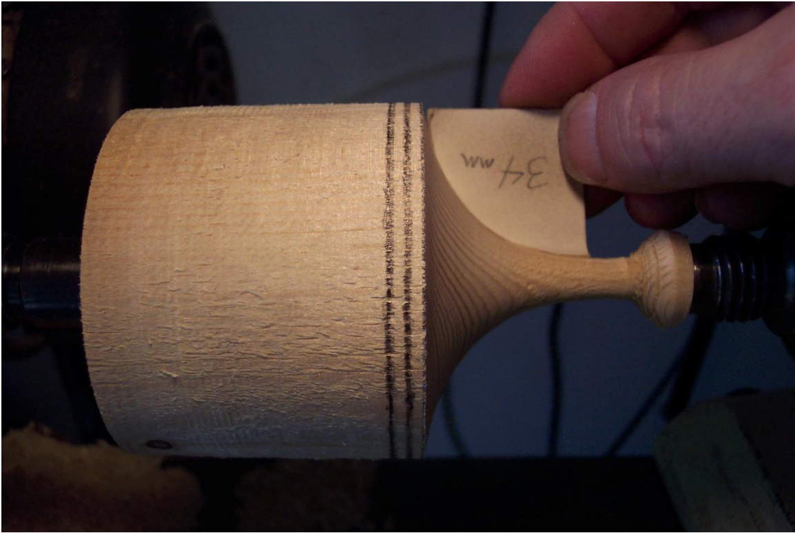
The right side is completed.

Turn the curve on the right side first and check it against your template regularly. Once you're satisfied that the curve matches the template, repeat the process on the left side. The vertical center will be left with square edges. If you want rounded edges (which I always do), then now is the time to do it. Sand it just enough to remove any tool marks since hand sanding will be necessary once the final assembly is glued together.