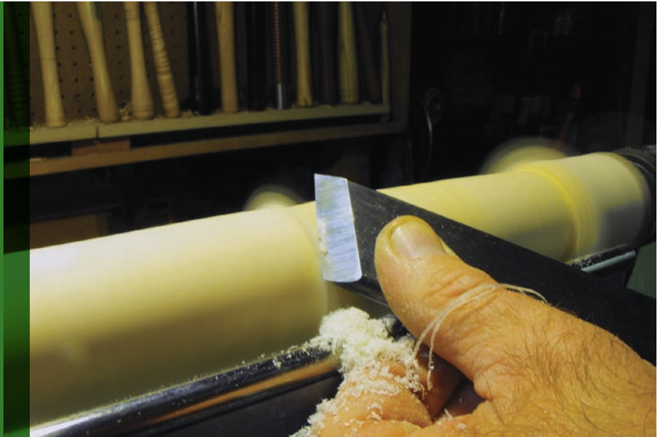
The planing cut, made with the skew chisel's bevel rubbing, leaves a surface requiring minimal sanding.

T he skew chisel, one of the most versatile spindle-turning tools, has a bad reputation. It is sometimes the butt of woodturning jokes: “I brought along my skew chisel,” says a demonstrator, “for opening this can of paste wax.” Many otherwise expert turners refuse to use the skew. Yet others, having mastered its use, swear by it.