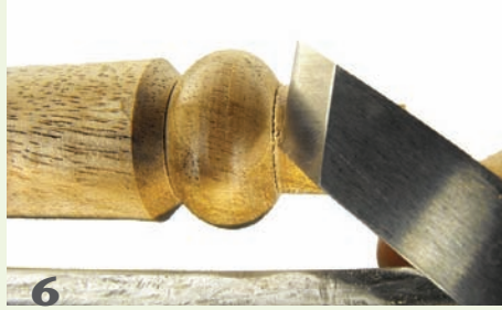
6 Finish cutting the fillet by advancing the tool as you would for a planing cut.