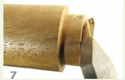
7 To achieve a clean cut on endgrain, use just the toe of the skew chisel. To avoid a catch, lean the left-side bevel slightly away from the endgrain (exaggerated here to illustrate the concept).

and gives an unobstructed view of the cutting action. The result is a clean cut with little tendency for a catch.