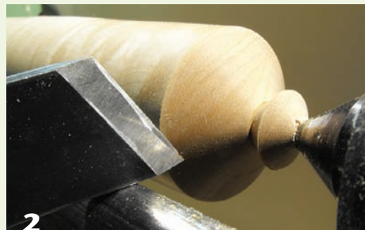
2 Here, the skew is being used to turn the left side of a V-groove shape. The tool is presented with the long point down and rotated very slightly clockwise so the bevel can “float” behind the cut.