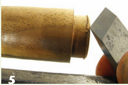
5 Position the bevel of the skew chisel parallel to the wood to begin cutting a fillet.