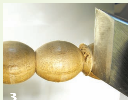
3 Beads can be formed with a skew using either the short point (heel) or a small portion of the cutting edge with bevel support (pictured here). Notice with this method the cutting action is near the horizontal centerline of the turning, so the cut stays on the same plane from start to finish. When the heel is used for cutting, the action begins near the top of the cylinder and finishes near the centerline.