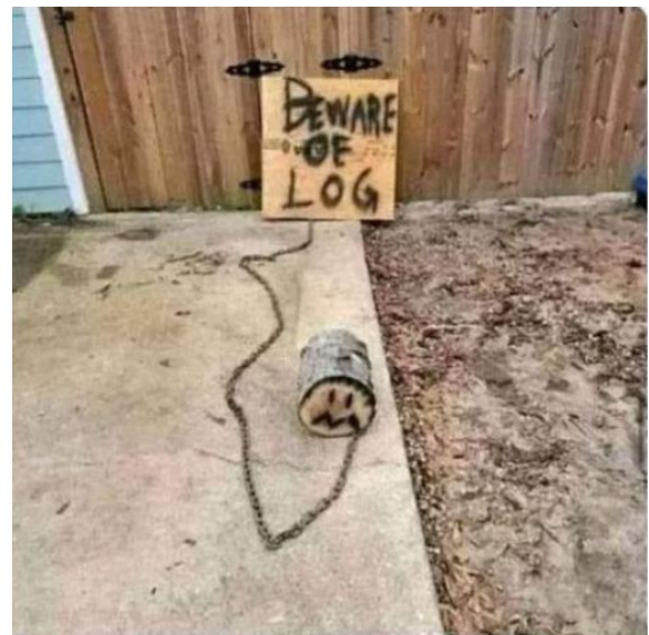
He's all Bark and no Bite