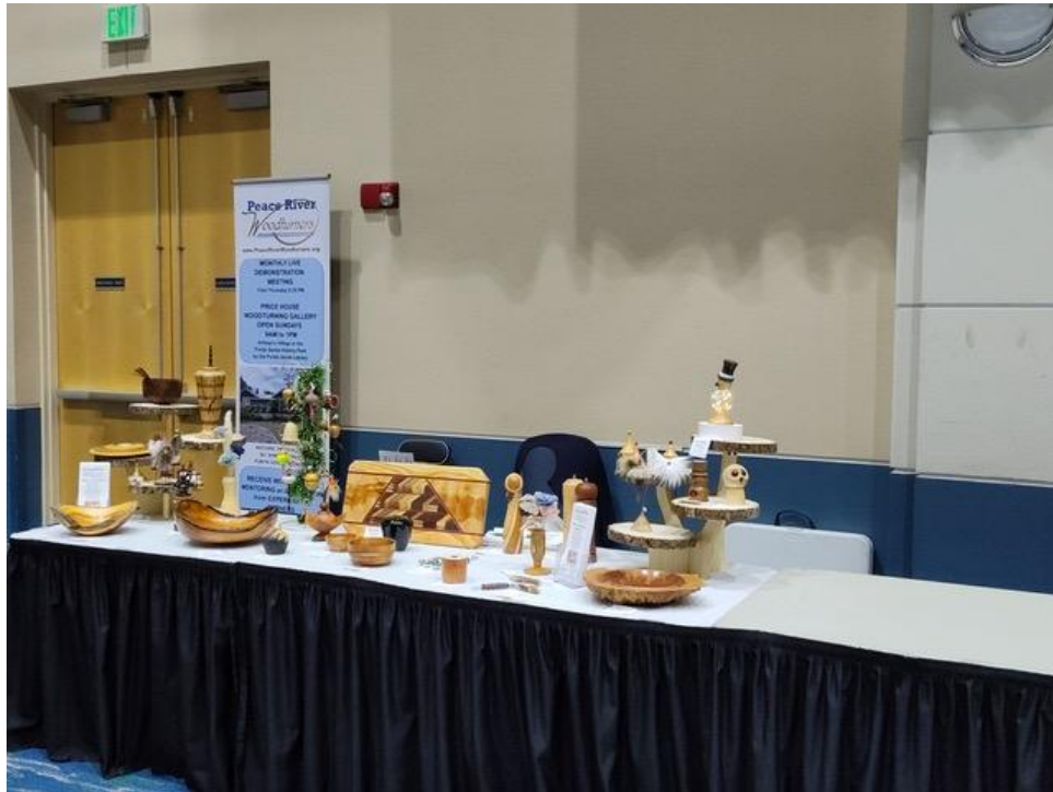
PRW Display Booth at the WoodArt Expo

Congratulations to all the New Novice turners that took the plunge and entered pieces into this years WoodArt Expo in Punta Gorda. Your hard work has paid off and we all were thrilled to see your accomplishments and the awards that went with your work.