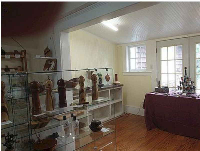
New Glass Showcase