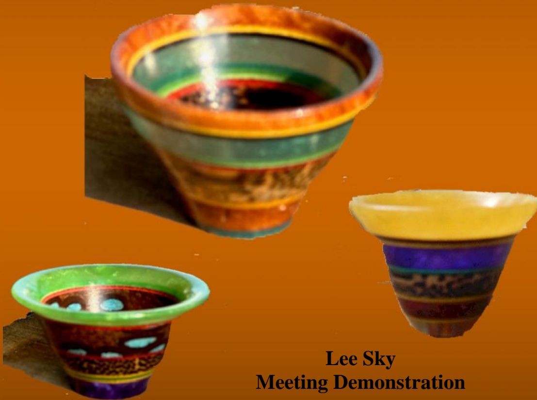
Lee Sky Meeting Demonstration

Providing an environment that fosters the art and craft of woodturning A Publication of the Peace River Woodturners