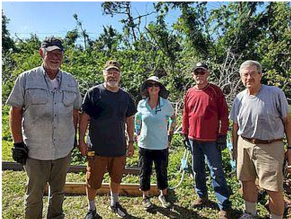
Price House Deck Crew