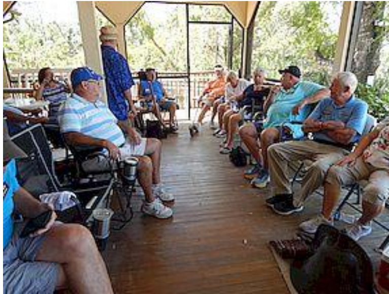
Great day for a picnic and the clubs porch was delightful with many members attending.

Great selection of food and Croquet equipment at the March Picnic. Picnic was held on the History park grounds where our meetings are held.