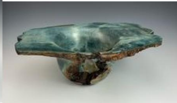
Frank DiDomizio Burl Natural Edge