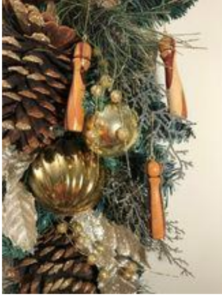
Rod Castle Peppermill Earrings