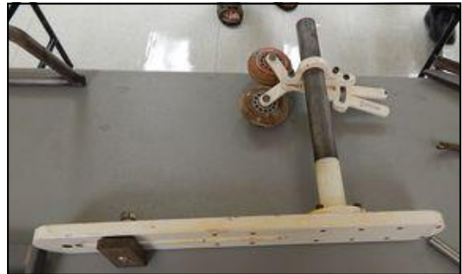
Oneway Steady Rest