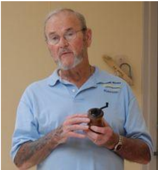
Rawson Beals Grinder