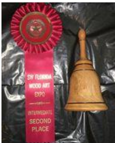
Bil Tucker Bell