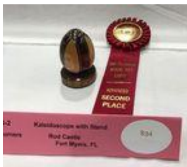
Rod Castle Kalidoscope