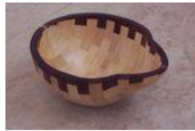
Ted Beebe Bowl