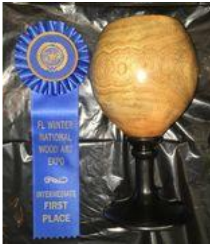
Bil Tucker Goblet