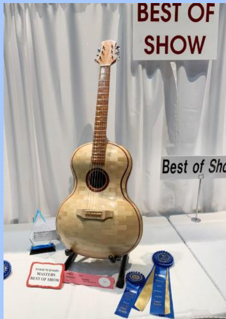
Ted Beebe Best of Show Masters