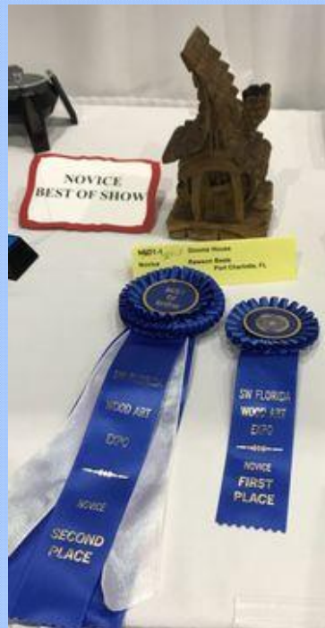
Rawson Beals Best of Show- Carving

Providing an environment that fosters the art and craft of woodturning A Publication of the Peace River Woodturners