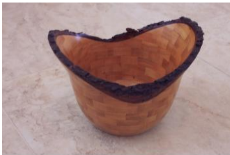
Ted Beebe Natural Edge Segmented bowl