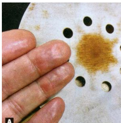
A Ebony contains oils that easily rub off on fingertips and show on the sanding pad.