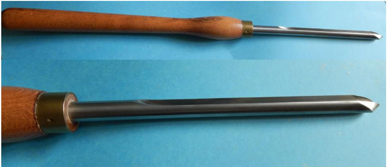
Brand New David Ellsworth 5/8" Bowl Gouge $45.00