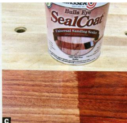
C Wax-free shellac brings out the inherent color of the stock. Standard shellac contains wax, which can compromise good topcoat adhesion.

The thought of applying finish to a project can be enough to kick up your pulse rate and blood pressure, especially when the project contains an “exotic” wood full of natural oils [Photo A]. That’s because the oils and resins in woods such as cocobolo, rosewood, padauk, purpleheart, teak, and even eastern red cedar can markedly slow or practically stop a finish from bonding or curing. These wood species require different preparation before finishing. Follow these helpful tips to make the process smooth as silk.