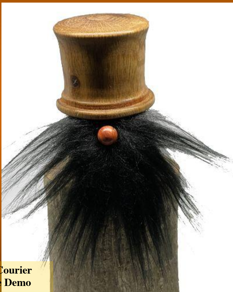
Louis Courier Gnome Demo

Providing an environment that fosters the art and craft of woodturning