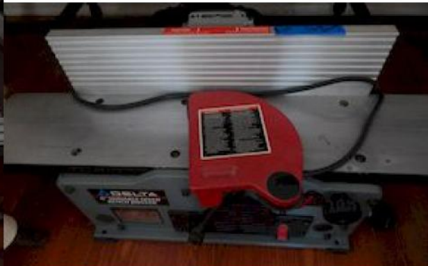
Delta Bench Top Jointer