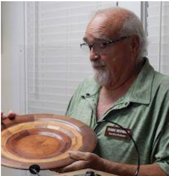
Sorry, could not read name badge