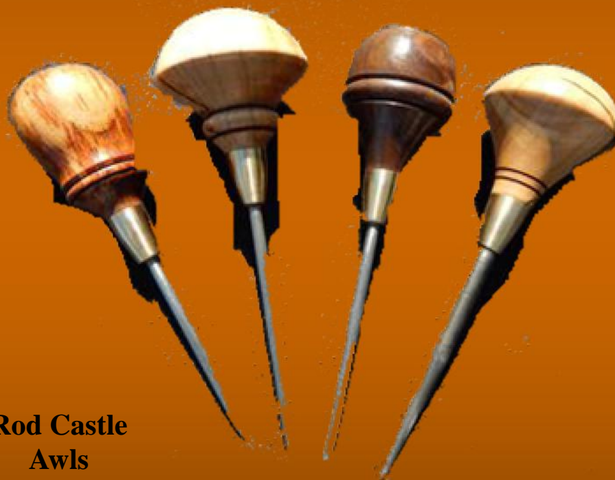
Rod Castle Awls

Providing an environment that fosters the art and craft of woodturning