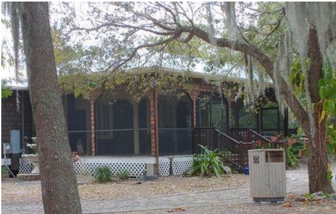
Price House Porch View where April Meeting will be held