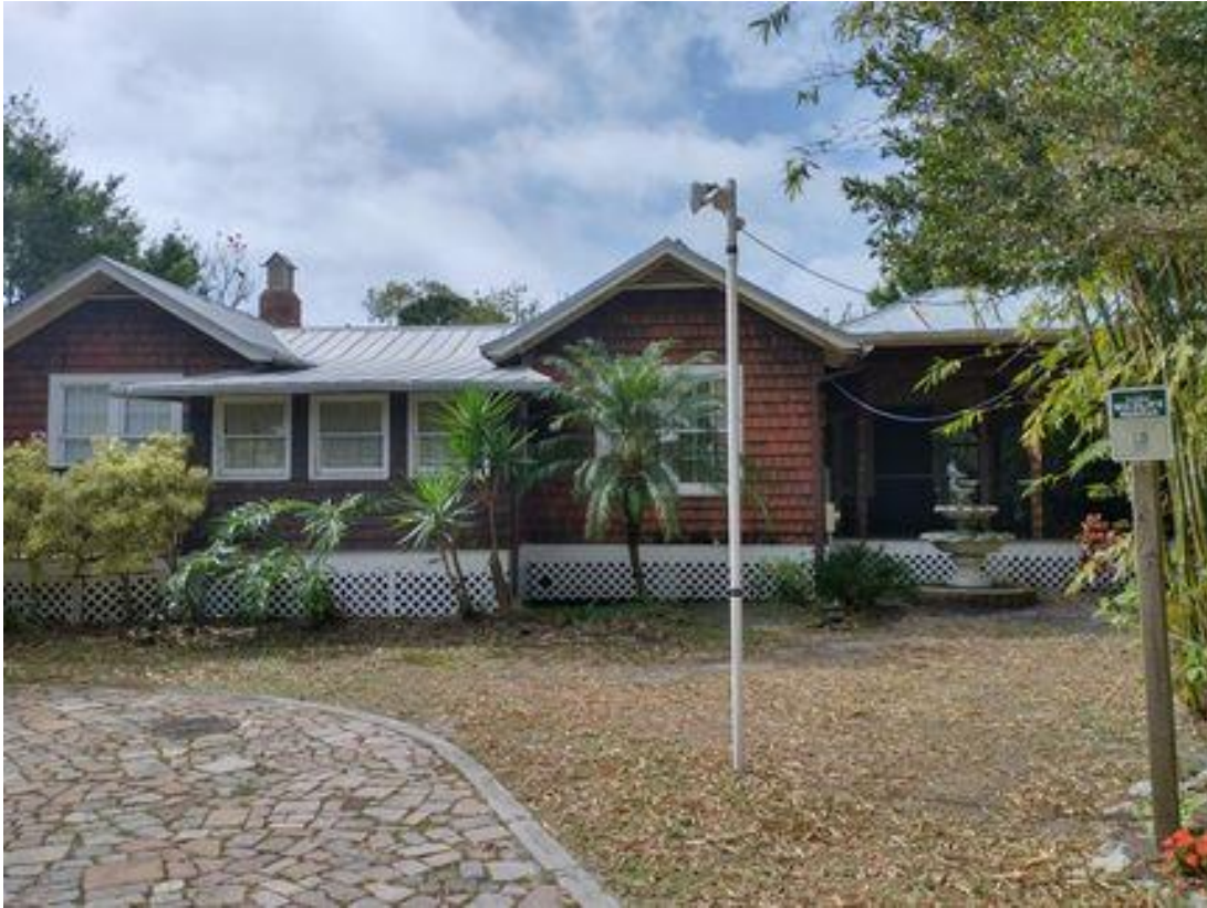
History Parks Price House....New Meeting Site