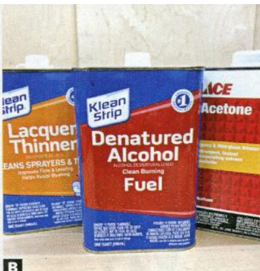
B These solvents remove any surface contamination and the natural oils in many exotic woods. The solvents dry quickly and won't leave any residue to interfere with topcoat adhesion.