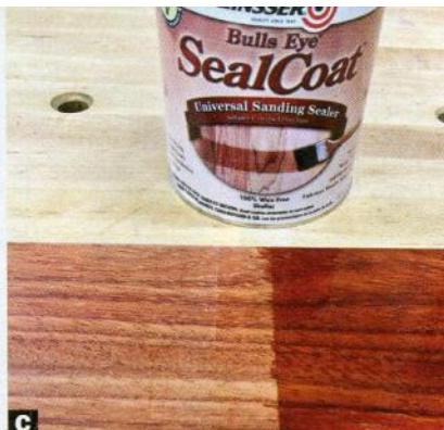
C Wax-free shellac brings out the inherent color of the stock. Standard shellac contains wax, which can compromise good topcoat adhesion.

The thought of applying finish to a project can be enough to kick up your pulse rate and blood pressure, especially when the project contains an “exotic” wood full of natural oils [Photo A]. That’s because the oils and resins in woods such as cocobolo, rosewood, padauk, purpleheart, teak, and even eastern red cedar can markedly slow or practically stop a finish from bonding or curing. These wood species require different preparation before finishing. Follow these helpful tips to make the process smooth as silk.