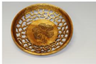
Dom Dinino - pierced bowl turned from mamosa wood.