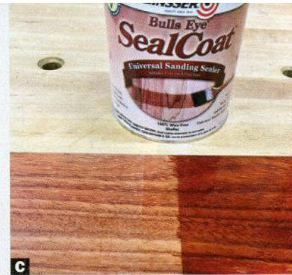
C Wax-free shellac brings out the inherent color of the stock. Standard shellac contains wax, which can compromise good topcoat adhesion.

The thought of applying finish to a project can be enough to kick up your pulse rate and blood pressure, especially when the project contains an “exotic” wood full of natural oils [Photo A]. That’s because the oils and resins in woods such as cocobolo, rosewood, padauk, purpleheart, teak, and even eastern red cedar can markedly slow or practically stop a finish from bonding or curing. These wood species require different preparation before finishing. Follow these helpful tips to make the process smooth as silk.