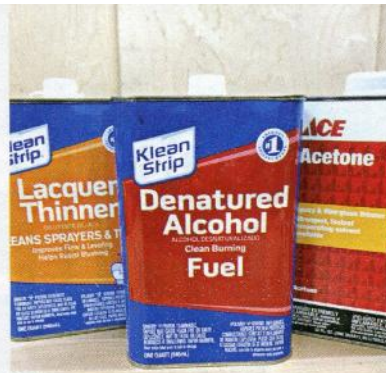
B These solvents remove any surface contamination and the natural oils in many exotic woods. The solvents dry quickly and won't leave any residue to interfere with topcoat adhesion.