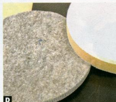
D For decorative projects that aren’t handled frequently, simply buff the natural oil with a lamb’s wool, left, or a synthetic buffing pad, right, on a random-orbit sander. This provides an incredibly smooth—though not very protective—surface.

► Learn more about the benefits and uses of shellac. woodmagazine.com/shellacfinish