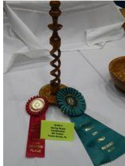
Bill Tucker Second Place Novice