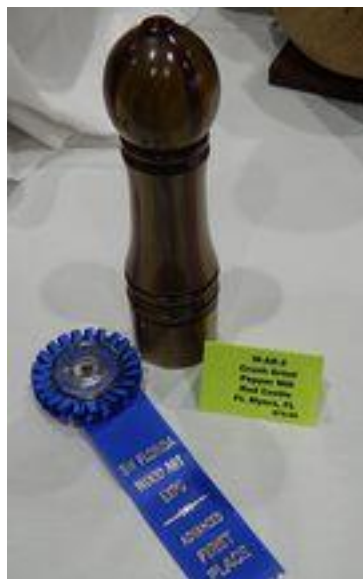
Rod Castle First Place Advanced