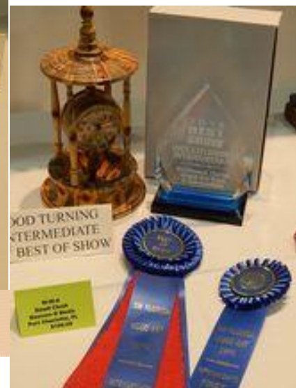
Rawson Beals Intermediate