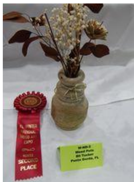
Bill Tucker Second Place Novice