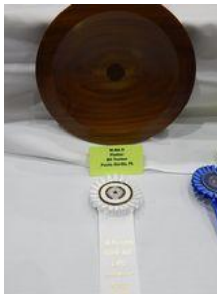
Bill Tucker Second Place Novice