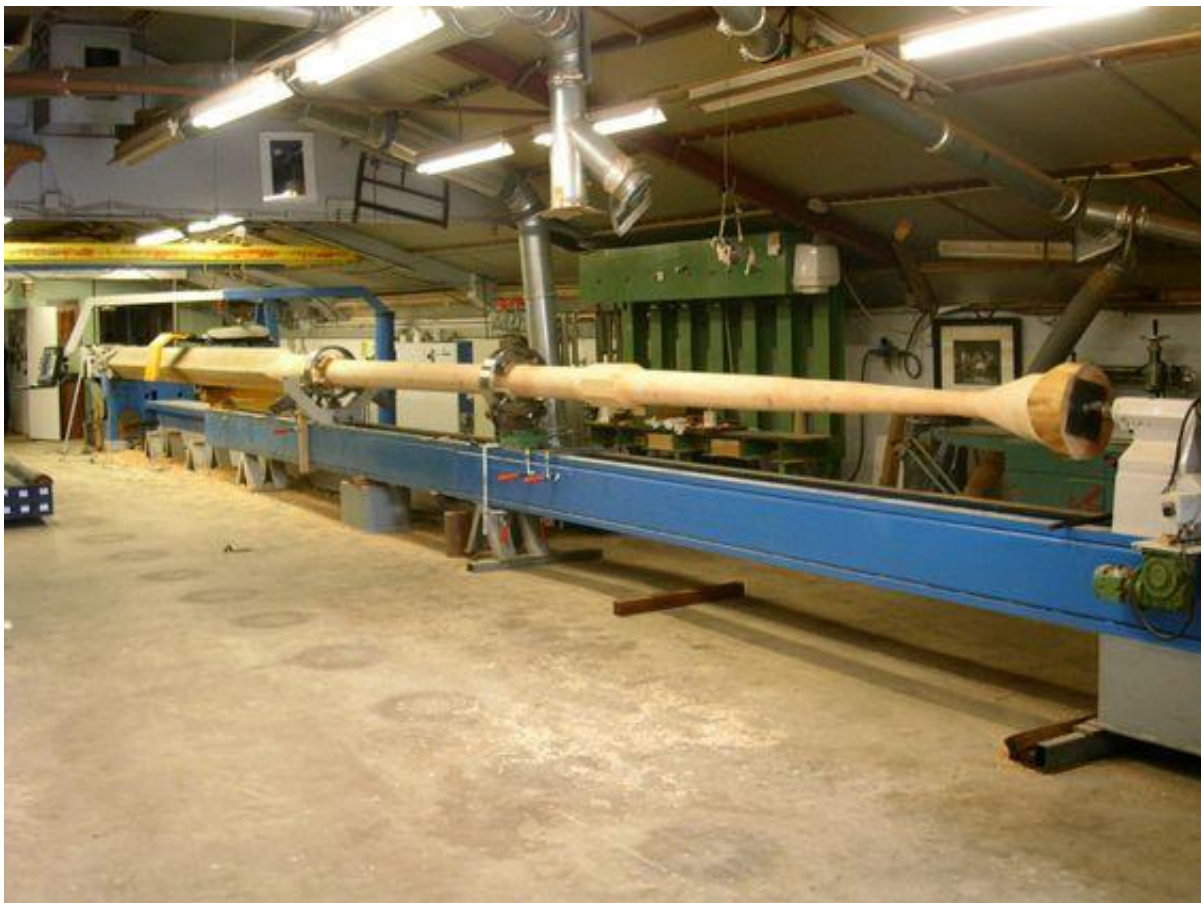
For those that like to turn Spindles