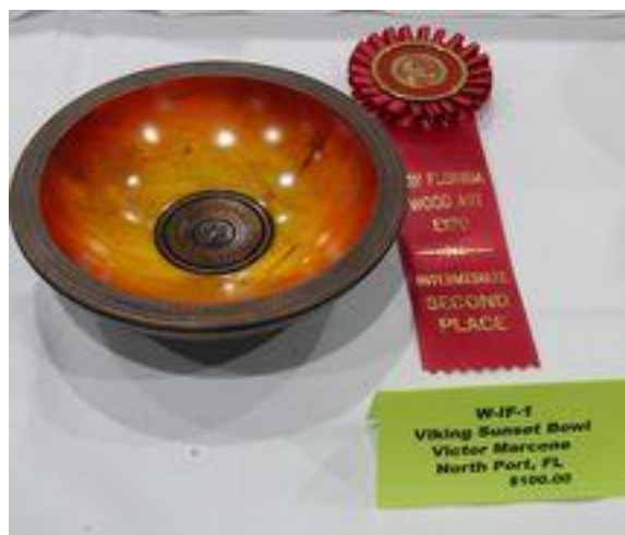
Victor Marccone Second Place Intermediate