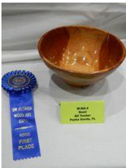
Bill Tucker First Place Novice