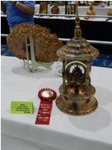
Rawson Beals Second Place Intermediate