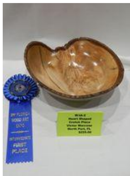
Victor Marcone First Place Intermediate