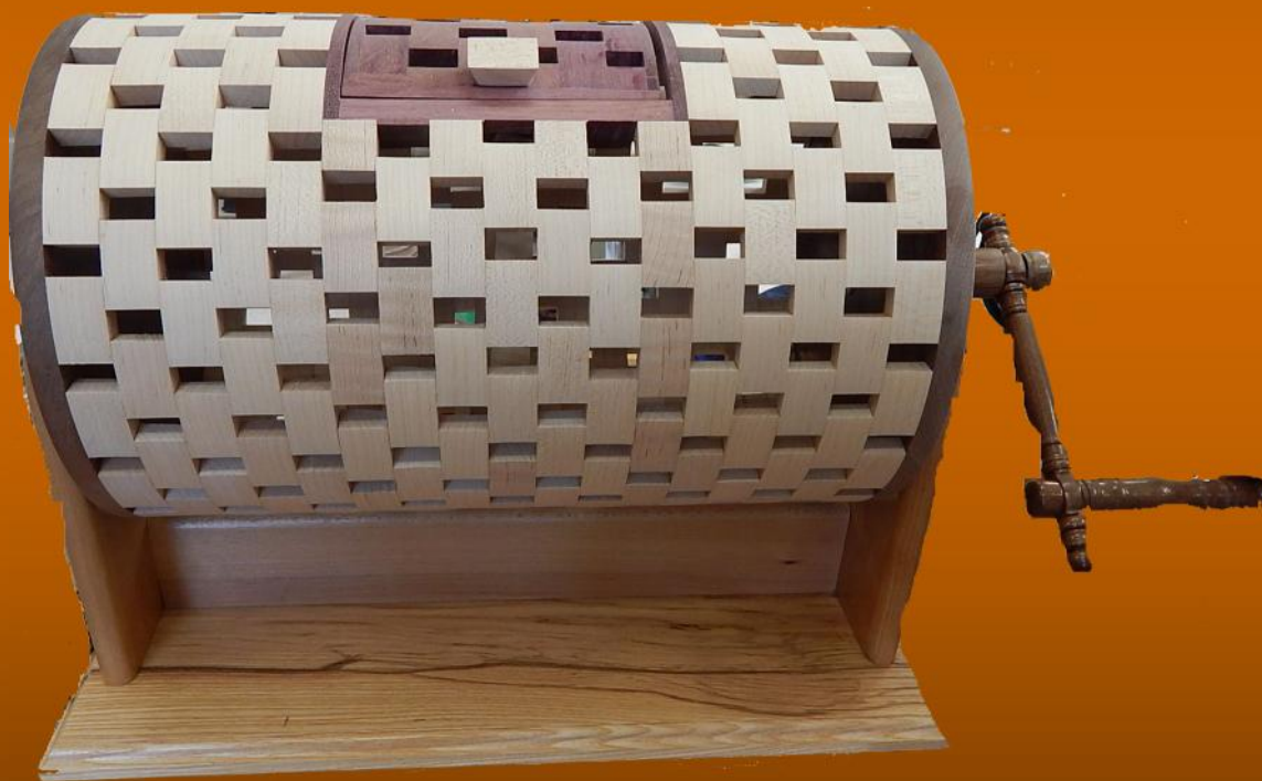
Clubs New Raffle Ticket Barrel

Providing an environment that fosters the art and craft of woodturning A Publication of the Peace River Woodturners