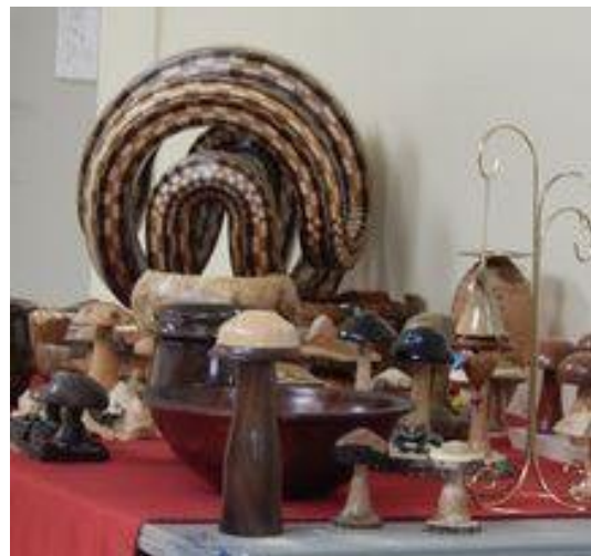
Show & Tell Table