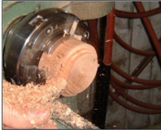
Jamb chuck box on stub left in chuck.