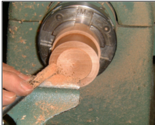
Cut bottom off box.