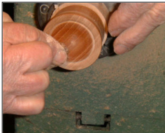
Sand and put finish on bottom of box.