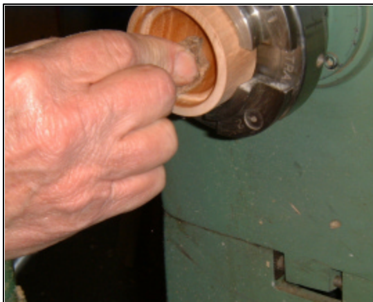
Sand and finish inside and end surfaces. Do not sand contact section.

Make inside edges parallel and minimum 1/4" long.