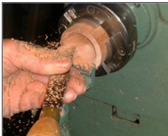
Form lid contact section.

Make inside edges parallel and minimum 1/4" long.